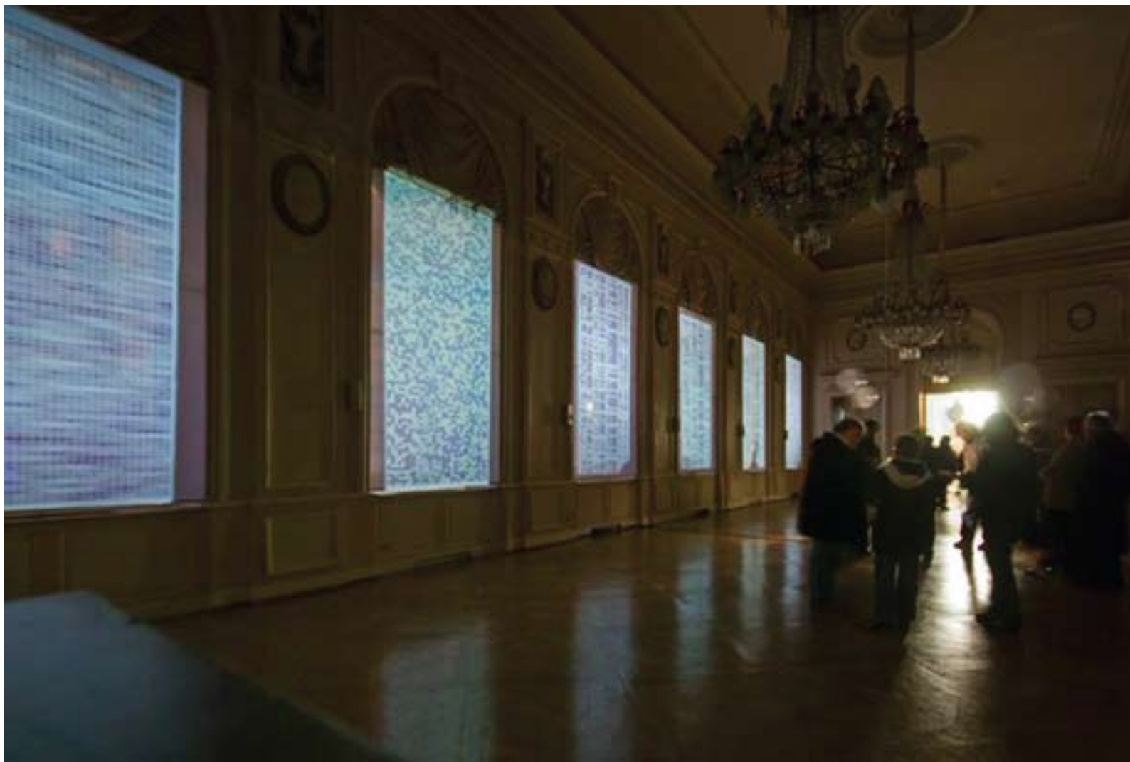
view of the installation 6 channels low resolution projection