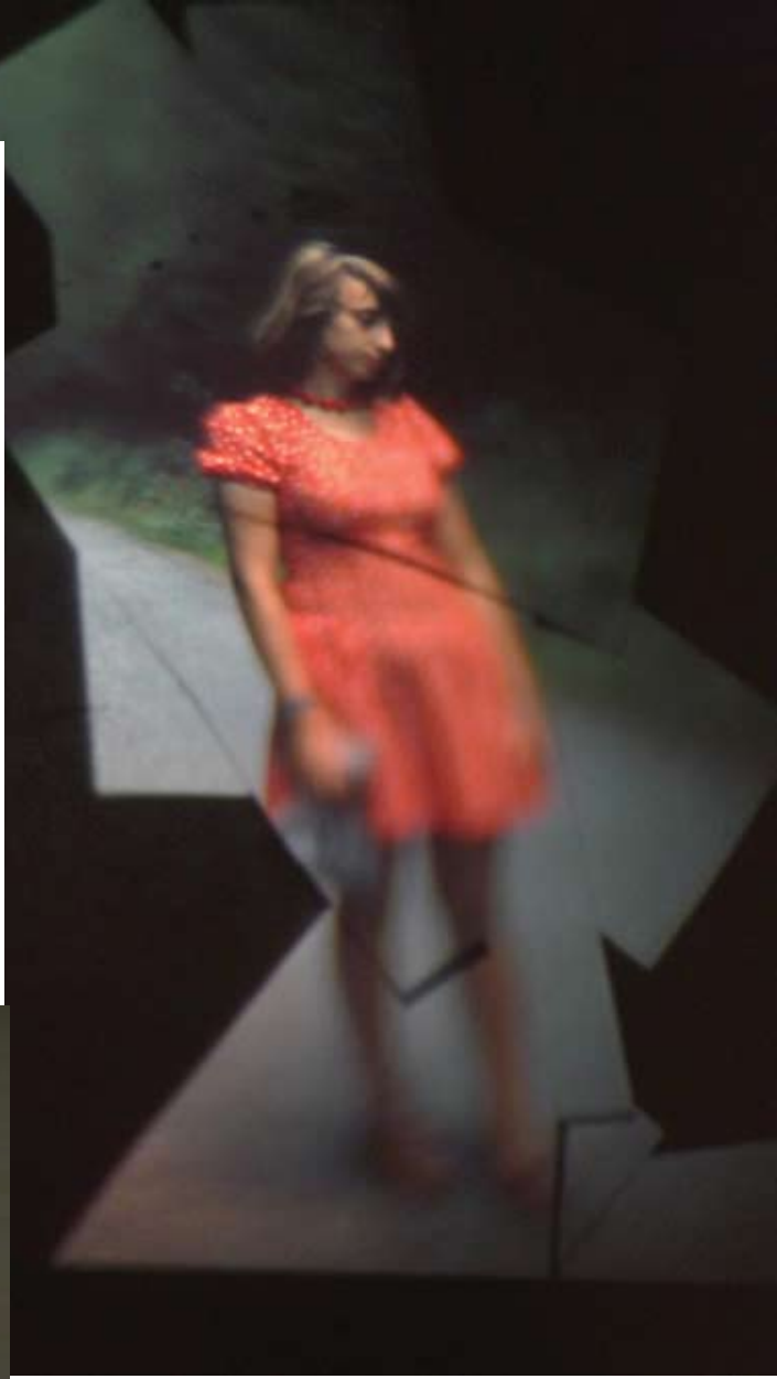
view of the projection "The Memory Cone", 2009

The installation, use a disassembled video projector, the micro mirror device have been take out from the video beamer and receive directly the reduced slide projection. The video beamer is connected to a camera that film the hand of the performer who organize some simple pieces of papers (white or gray)