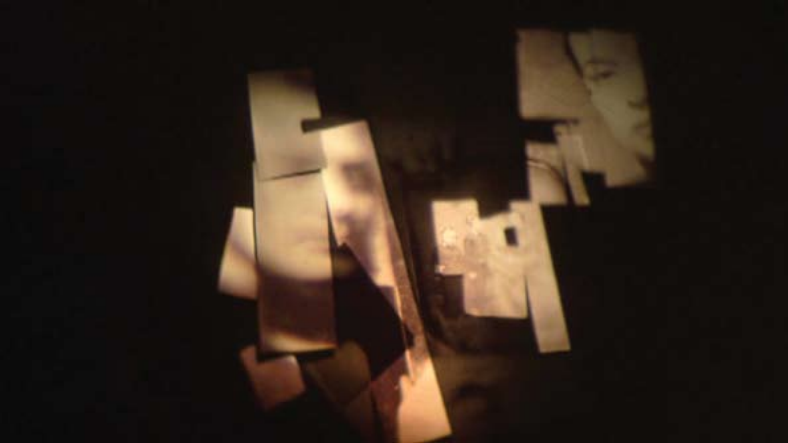
view of projection

The performer chooses some details simply by moving the pieces of paper on a table. He discovers and recomposes slowly a global memory or performs a selective remind of a moment. Some pictures are trivial some other contains a large amount of information. Past and present medium are here in fusion in one shot: a projection of a moving plane (the video) is directly confronted with a still, there are two very different layers and they continue to carry their own visual basic properties.