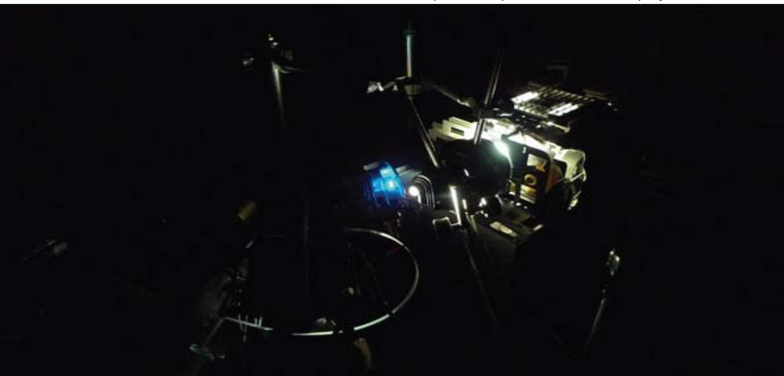
view of the optical setup on the table ( slide projector and lenses )

The system is working with all kind of positive film material, 35 mm, 8, or 16 mm film as well as all kind of still pictures and also episcopes projection which make possible to use all kind of paper / reproduction and archives