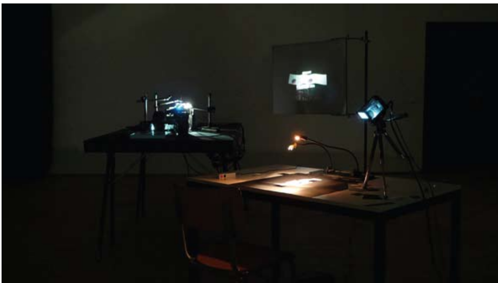
view of the installation STUK Leuven, BE

Julien Maire "The memory cone" , 2009 production Artefact festival , Groep T , Leuven 2009