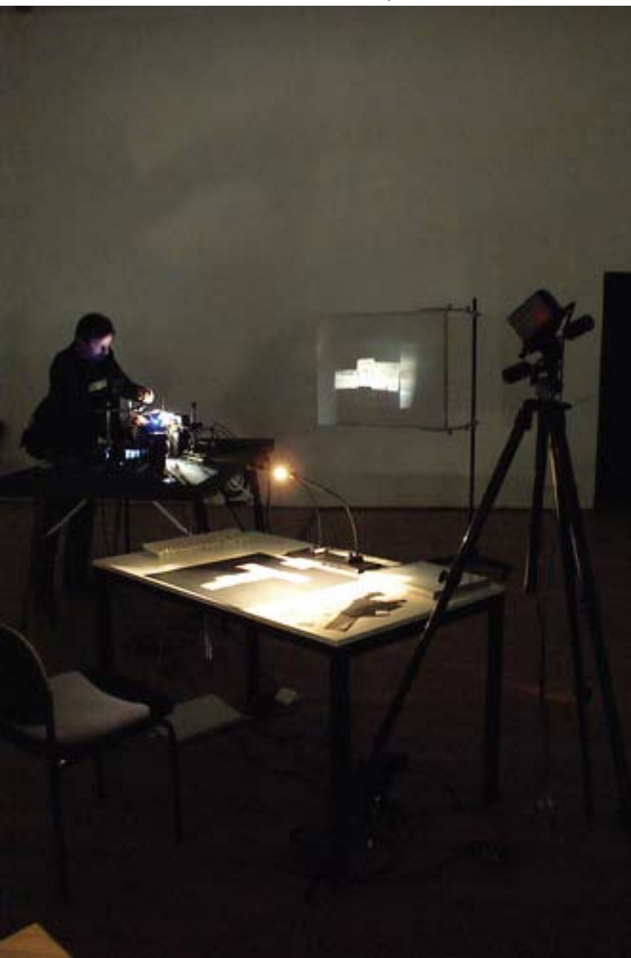
view of the installation "The Memory Cone", 2009

DMD (Digital Micro-Mirror Device) are commonly used in video projector, they perform the "digital light processing" or DLP developed by Texas Instruments.